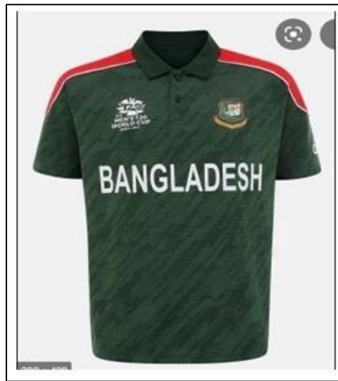
Jersey in 2021 World cup