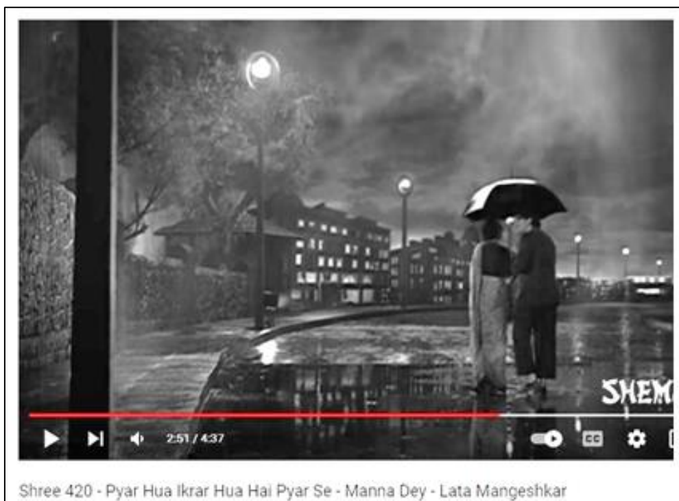
Raj Kapoor- Nargis Dutt (1955)

The Bollywood song ‘Character Dheela Hay’ (2011) imitates the landscape of the old Hindi song “Pyar Hua Ikrar Hua” (1955). Here, Salman Khan & Zarine Khan, for a few second, creates the romantic environment imitating the old Hindi song of 1955. Therefore, the landscape in 2011’s song is a pastiche.