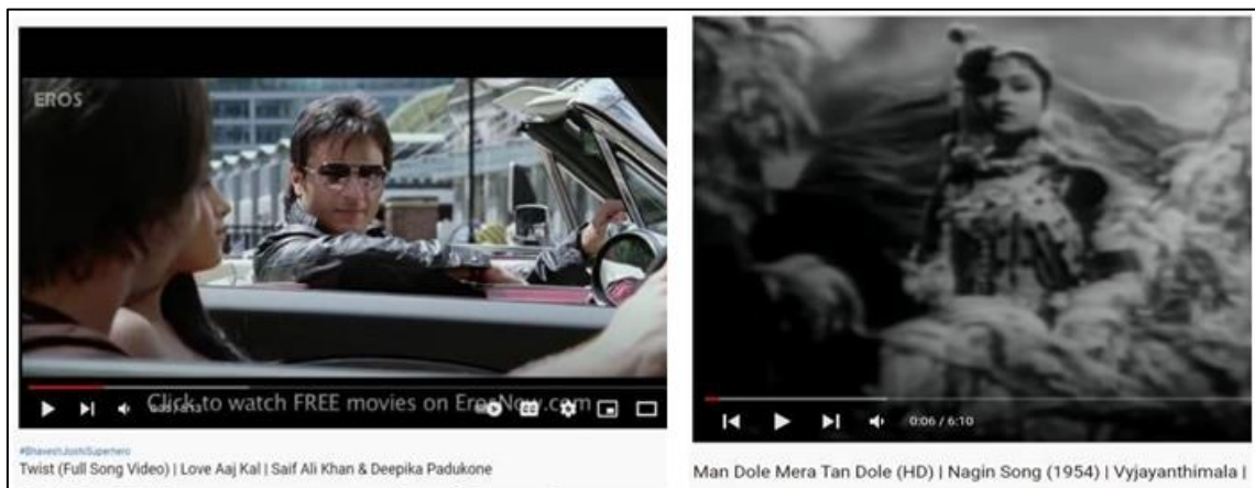
The Bollywood song 'We Twist' (2009) imitated the music of the old Hindi song 'Nagin'