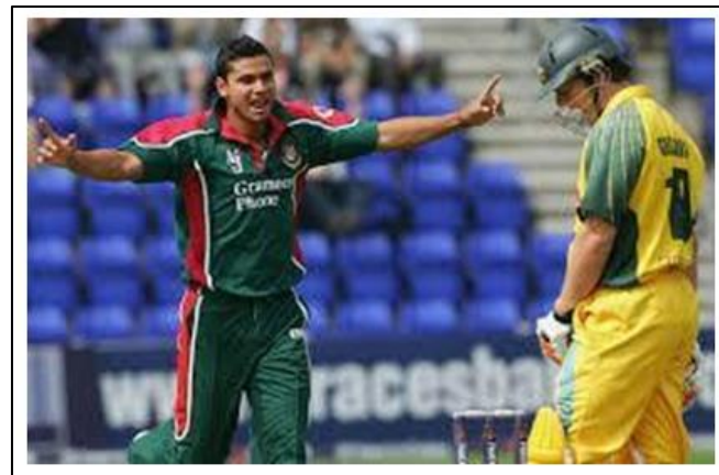
Jersey in 2005

The Design of the jersey of Bangladesh Cricket in T20 World cup 2021 imitated the jersey of Bangladesh Cricket 2005. The jersey of 2005 has a memorable victory against Australia. From that nostalgic view, Bangladesh Cricket imitated the jersey of 2005, glorifying their victorious past. Therefore, the Jersey of T20 Wc 2021 is a pastiche.