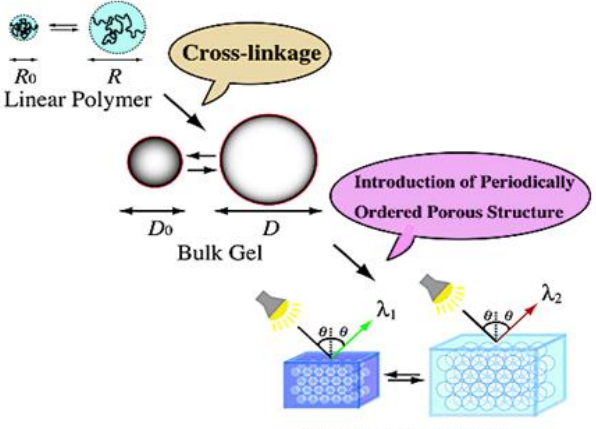
Structural Colored Gel