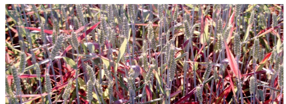
Fig-6: As the Virus infection progress the entire leaves are become discolored and may die prematurely