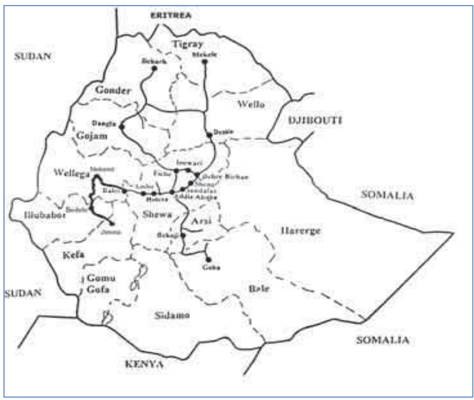
Fig-3: Map showing BYDV surveyed areas and routes in Ethiopia

The information generated was scanty inconclusive and unrepresentative. This paper reviews research results from systematic intensive and representative surveys on the occurrence and distribution of BYDVs and in the major barley growing areas; the impact of the dominant BYDV species (BYDVPAV) on the yield and growth of barley.