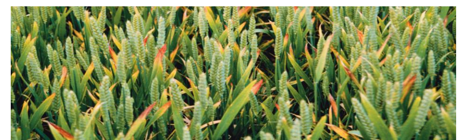
Fig-5: Symptoms of BYDV in wheat Redding or yellowing starts at the tip of the leaf and infected leaves are usually twisted

Symptoms of BYDV infection include leaf discoloration, stiffening or curling of leaves, death of leaf tissue, stunting of the plants, reduced tillering, and even plant death. Leaf discolorations can range from yellow in barley, rye, and wheat to orange or tan, to red or purple in oats and wheat. Leaf discoloration begins at the tip and progresses down to the base of the leaf. On a field scale, the formation of numerous bowl-shaped depressions about 3 to 8 feet in diameter are another symptom of YDV infection .This "field signature" is especially visible at flowering. Infected plants in the center of depressions are stunted and tend to have severe leaf discoloration. Plants toward the perimeter of the patches show less stunting and leaf discoloration. Research in Virginia has shown that these stunted areas yield about 30 percent less grain than non stunted areas.