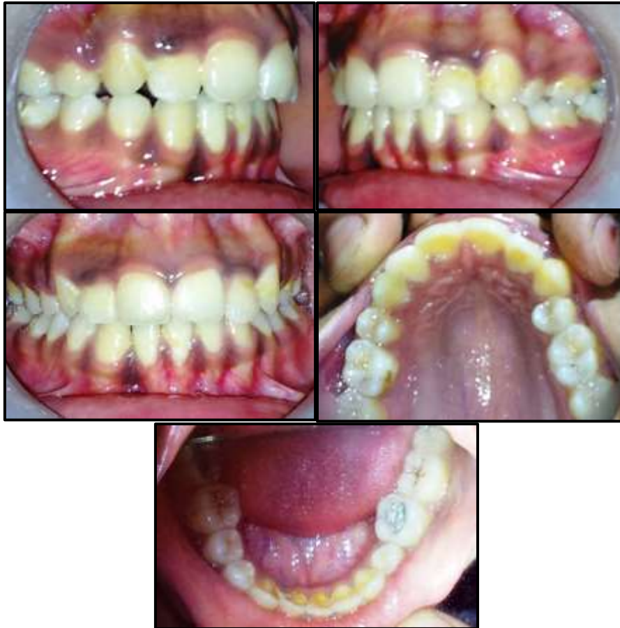
Fig-4: Post treatment intra oral photographs