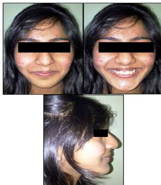
Fig-3: Post treatment extra oral photographs