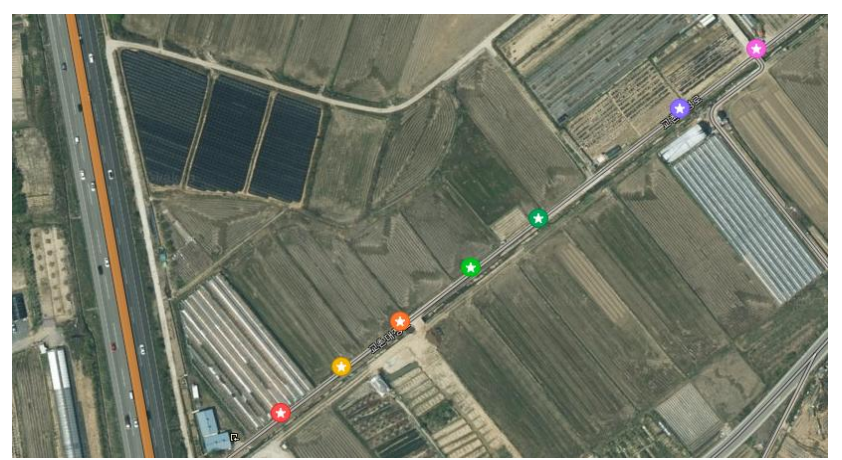
Fig-2: Seven GPS values on Kakao map system