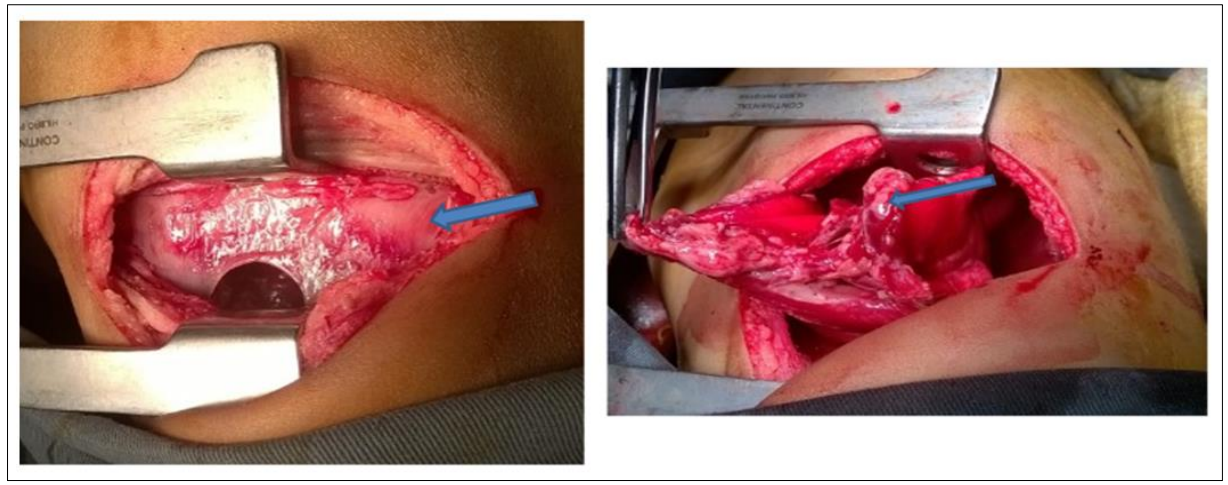
Figure 3: Per operative picture shows (Lt.) pleural thickening and (Rt.) lacerated middle lobe of right lung due to abscess