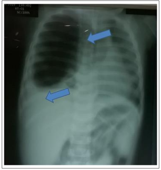
Figure 1: Chest x-ray A/P view shows hyper lucent area in right upper, mid and part of lower zone (arrow) extending to left side of chest having no bronchovascular marking with mediastinum shifted to the left. Dense homogeneous opacity was in right lower zone. Features are suggestive congenital lobar emphysema / pneumothorax with pneumonia (Rt)

managed with lobectomy of middle lobe, inj. linezolid after getting C/S which changed to oral form and recovered.