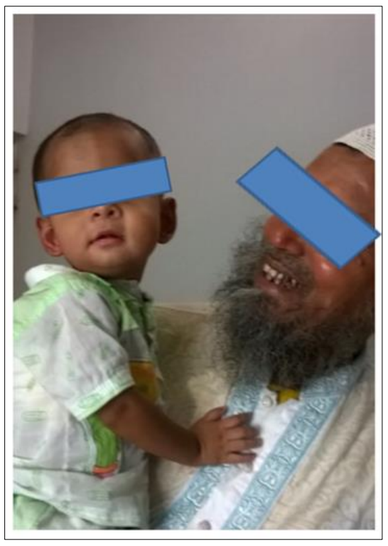
Figure 4: The boy with his father after recovery