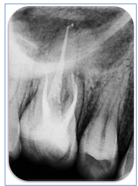
Fig-5: Postoperative IOPA Radiograph in relation to maxillary right first molar

Fig-4: Intraoperative IOPA radiograph with F1 Protaper GP Points and 6% #20 for MB2 as master cones