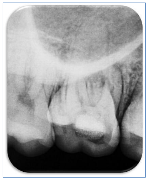
Fig-1: Preoperative IOPA radiograph of maxillary right first molar revealing a radiolucency encroaching pulp

location was done using #10 K files & endodontic explorer and 6 root canal orifices were located i.e Mesiobuccal-1(MB1), Mesiobuccal-2(MB2), Mesiobuccal-3(MB3), Distobuccal-1(DB1), Distobuccal-2(DB2) & Palatal(P) (Fig. 3) as described by Vertucci's type I for palatal, type II for distobuccal and additional type XVIII (3-2) for mesiobuccal. Working length was determined with the help apex locator which was re-confirmed using an IOPAR (Fig. 2). Cleaning and shaping was carried out by crown down technique using Rotary protaper gold files up to F1. Root canal irrigation was done with warm 3% sodium hypochlorite solution using side vented needles followed by saline wash. Each canal was dried with the help of sterile paper points and a dressing of calcium hydroxide was given followed by which the access cavity was sealed with cavit. At the second follow-up, the tooth was found to be asymptomatic, access cavity was opened and the canals were thoroughly irrigated with 17% EDTA, saline, 3% sodium hypochlorite & normal saline. Endodontic sealer was applied over the selected master cones and canals were obturated with corresponding F1 protaper gutta percha points and 6% #20 for MB2 using lateral condensation technique (Fig. 4). Post-endo build-up was done with glass ionomer cement and the patient was recalled after 7days for follow-up (Fig. 5). Patient was totally asymptomatic 1 week later, thereby crown preparation was done and the crown was fixed on the subsequent visit.