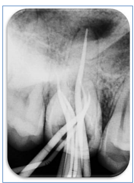
Fig-4: Intraoperative IOPA radiograph with F1 Protaper GP Points and 6% #20 for MB2 as master cones

Fig-3: Clinical picture of maxillary right first molar with 6 root canal orifices located (MB1, MB2, MB3, DB1, DB2, P)