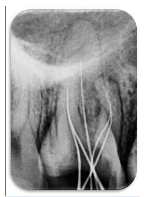
Fig-2: Intraoperative IOPA radiograph depicting the working length

Fig-1: Preoperative IOPA radiograph of maxillary right first molar revealing a radiolucency encroaching pulp