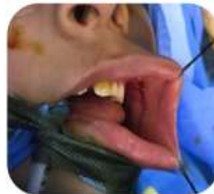
donor site is closed by using (3/0) polyglactin interrupted suture