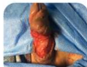
Dartos suture using (6/0) polyglactin interrupted suture, no drain was used