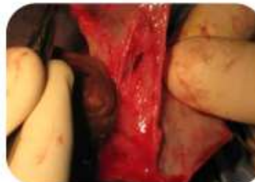
Adequate dartos fascia then dissected from adjacent tissue and moved without tension used to cover the graft