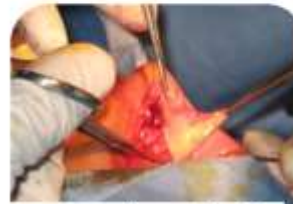
Buccal mucosal graft is harvested according to size of the defect