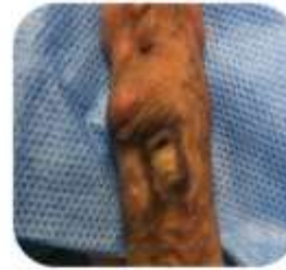
By using methylene blue, the circumferential incision is marked around the fistula (fistulas)