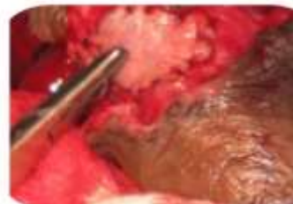
The graft sutured to the defect using (6/0) polyglactin inverted interrupted suture