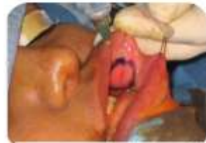
Donor site is prepared for harvesting of graft