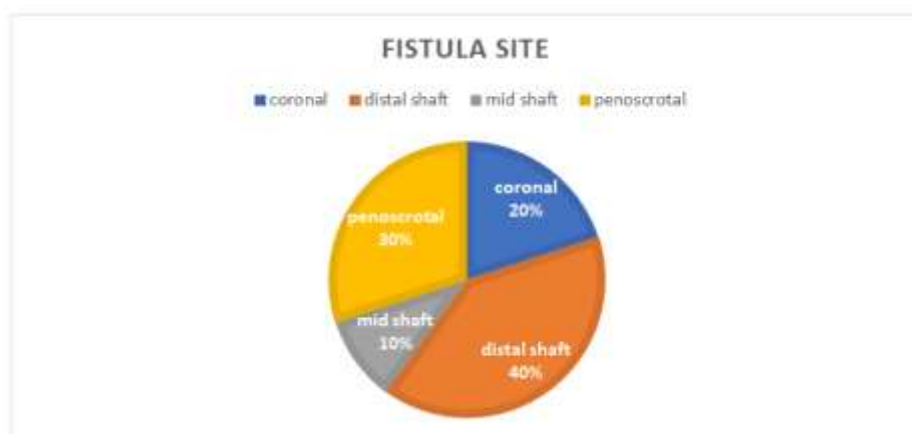
Figure 5: Fistula Site

Ten male patients presented to us with history of recurrent post hypospadias urethrocutaneous fistula. fistula size was ranging between (3.5 – 6) mm. number of fistulas was 1 in 8 patients and 2 in 2 patients. Site of fistula: 2 coronal, 4 distal shaft, 1 midshaft, 3 penoscrotal as following in figure (5):