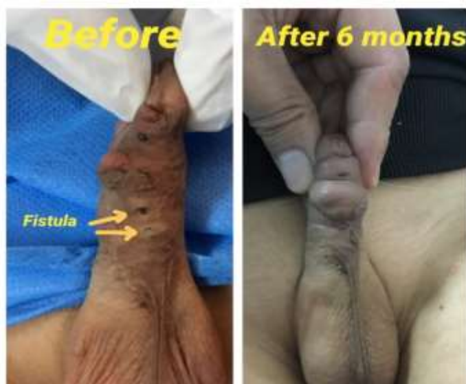
Figure 7: Pre & Post Fistula Repair case 1