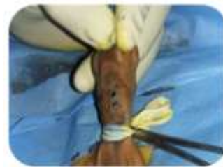
Methylene blue is injected in urethra to ensure the site and the number of fistulae