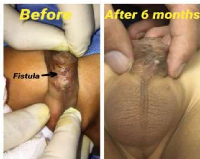
Figure 8: Pre & Post Fistula Repair case 2

Only one of our patients (number 9 who had 2 fistula) had recurrence of fistula (one fistula), and size of fistula was smaller than its size preoperatively (5mm versus 2mm). This patient had postoperative catheter obstruction and was scheduled for another operation later one.