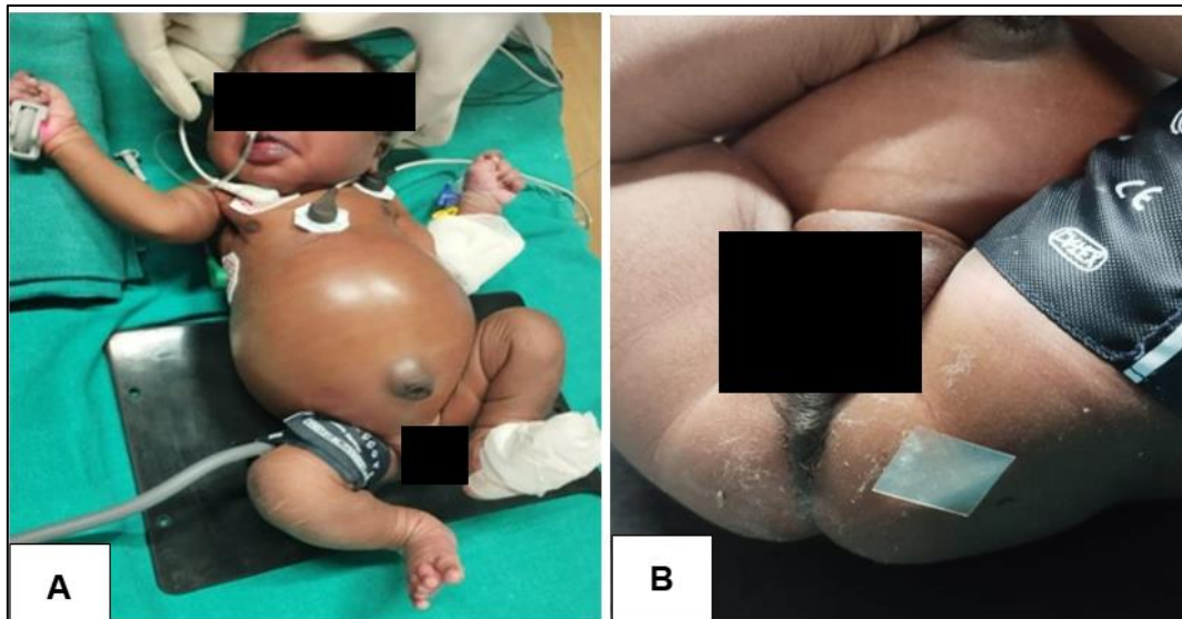
Fig 1: A. Photograph of the neonate at presentation showing abdominal distension. B. Photograph of the perineal region of the neonate with no external anal opening visualised

Urgent investigations revealed leucocytosis (15340/mm 3 ), hyponatremia (132 mEq/L), hypokalaemia (3.0 mEq/L) and hyperbilirubinemia (12.2 mg/dl) with serum indirect bilirubin of 11.4 mg/dl. Aspartate and Alanine aminotransferase measured 48 and 82 mg/dl respectively. Haemoglobin was 22.4 mg/dl. Invertogram (Fig 2A) and prone cross table lateral view