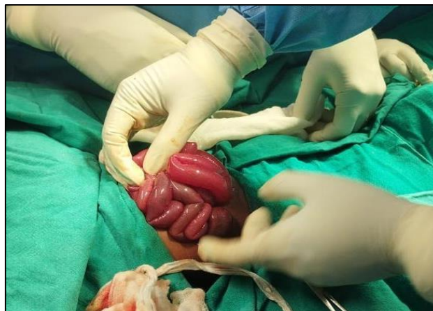
Fig 3: Intra-operative image depicting dilated but viable small bowel loops

The neonate gradually improved over next four days before developing burst abdomen on post-operative day five, which was managed with emergency wound closure. There was subsequent gradual improvement in the general condition, with the neonate accepting breast feeds on second day post wound closure. After seven days of the second surgical procedure when the neonate was tolerating breast feeds comfortably and all biochemical parameters were normal, the neonate was discharged. Instructions on colostomy care, regular follow-up and subsequent need for definitive surgery were explained to the mother. Written and informed consent was taken from the parent for inclusion of case details and images in the study.